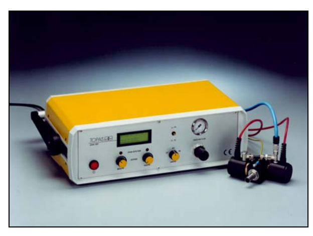
Electrostatic Aerosol Neutralizer EAN 581

The mechanical interaction of particles, especially solid ones, may cause undesirable levels of electrostatic charge. Test dusts must be generated with a high degree of reproducibility for instance when evaluating aerosol separation techniques such as cyclones, filters or impactors. Comparable results can only obtained at controlled and similar charge levels. The electrostatic aerosol neutralizer EAN 581 conditions the charge distribution on test dusts as well as other aerosols. Charge equilibrium can be controlled by mixing positive and negative ions in a precise manner.