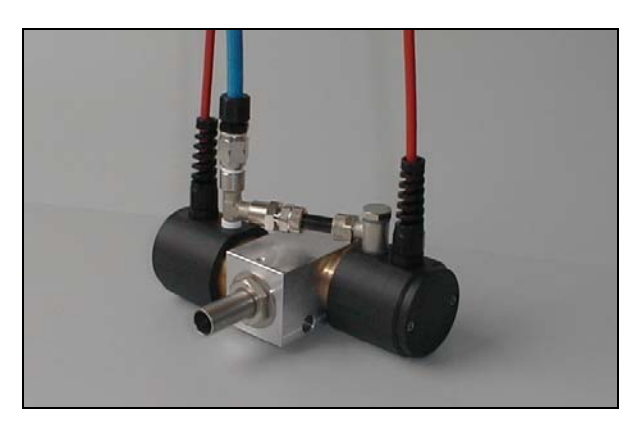
Mixing Chamber and Ionization Heads

The EAN 581 has been designed to be used in conjunction with a wide range of aerosol generators. Because particles from dust dispersers usually carry several thousand elementary charges the EAN 581 is an invaluable accessory for perfectly match as an accessory for the range of Topas dust and fibre dispersers in the SAG Series as well as devices other manufacturers'.